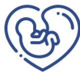
Obstetrics & Gynecology