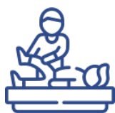
Physical Medicine & Rehabilitation