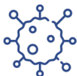
Allergy & Immunology