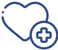
Post Acute Care Providers