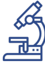
Pathology & Clinical Laboratories