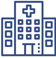
Hospitals & Health Systems