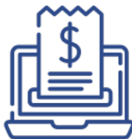
Medical Billing Companies