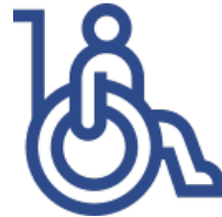
Durable Medical Equipment